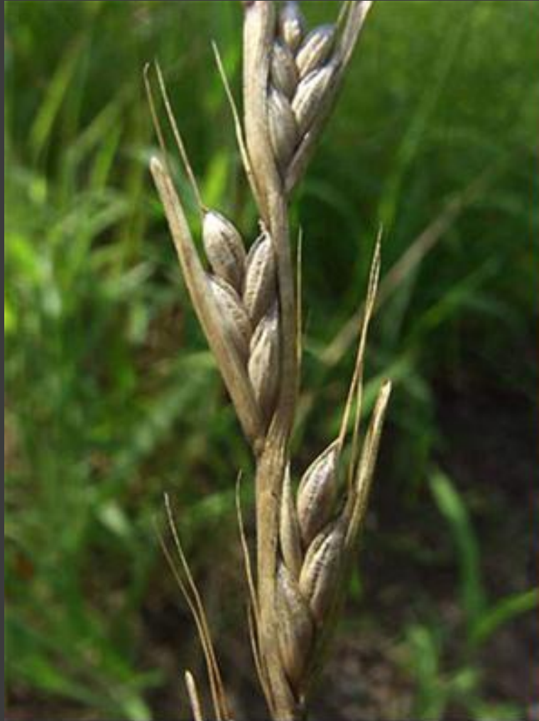
Tares - Darnell

At fruit time even a child can tell the difference